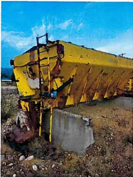
1977 Dodge Truck Vin: W24BE7S196746