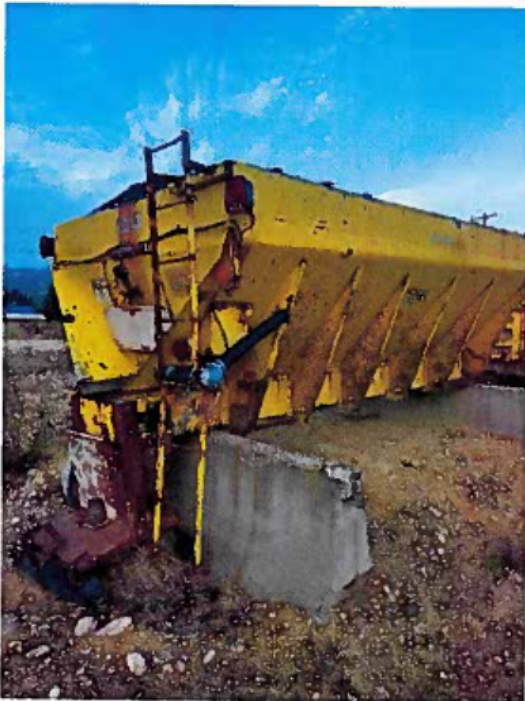
1977 Dodge Truck Vin: W24BE7S196746